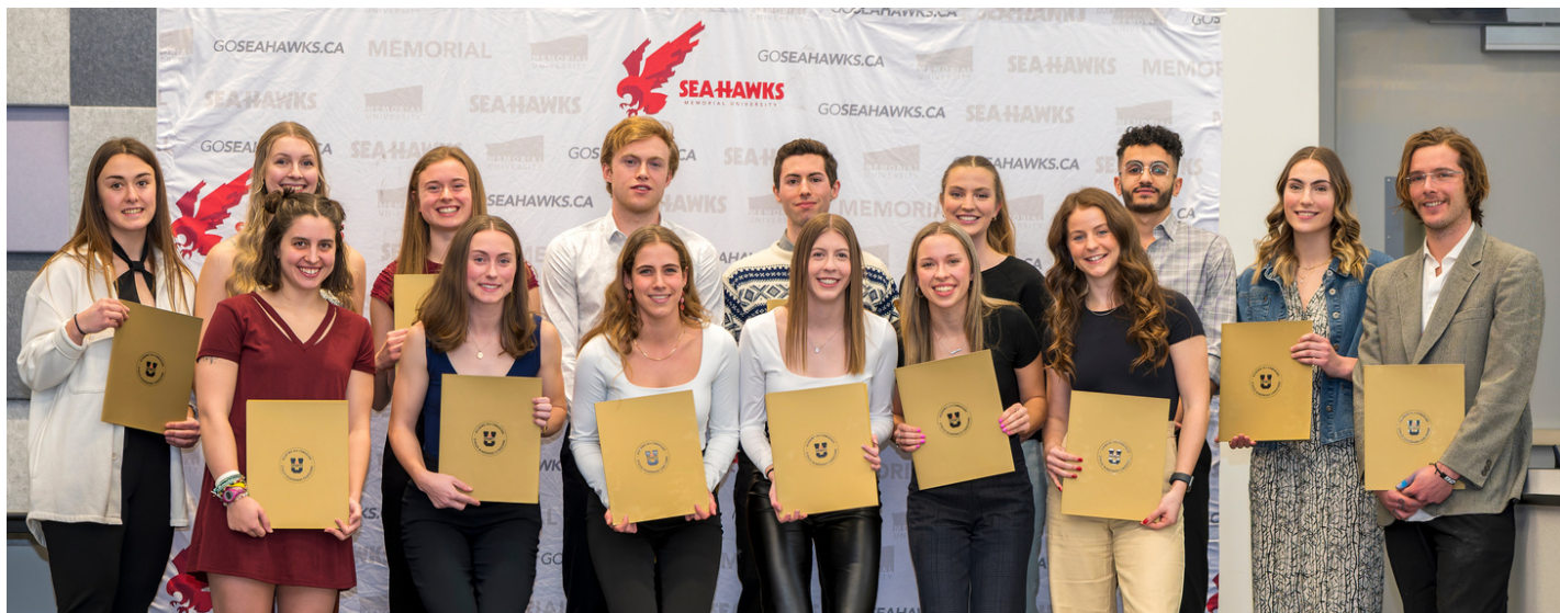
Science U Sports Academic All-Canadian recipients 2020-21 and 2021-22.