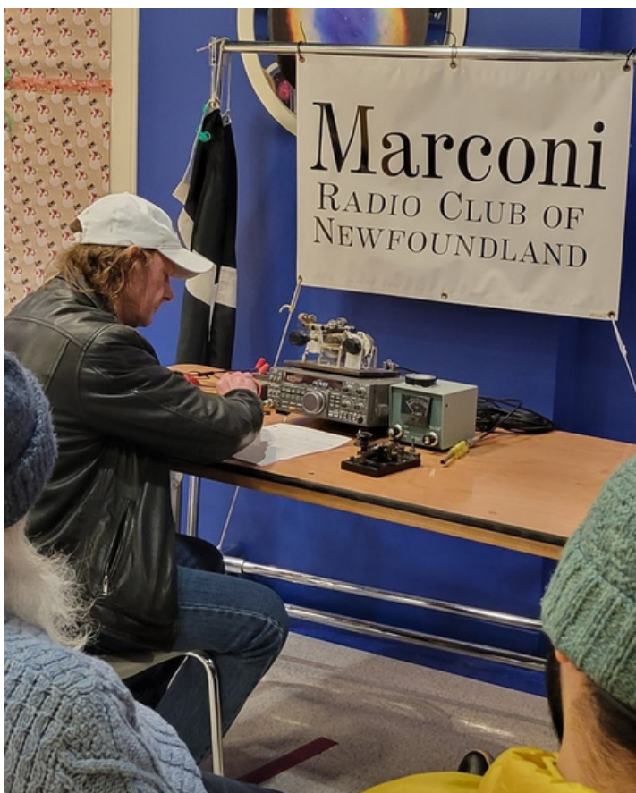
Physics and Physical Oceanography helped the Johnson Geo Centre and the Marconi Radio Club celebrate the 121th anniversary of Marconi's first transatlantic transmission.