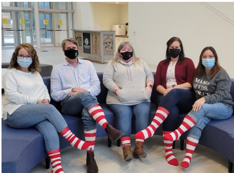
Biology staff Sock It for Sick Kids and their families, in support of Ronald McDonald House Charities.