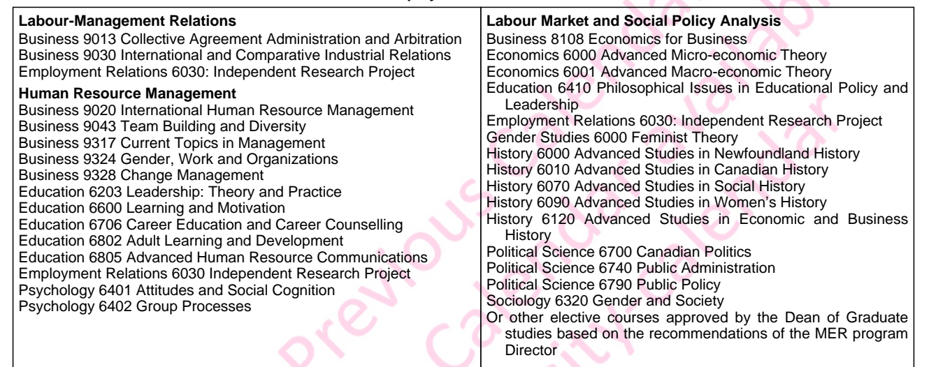
Table 2 Master of Employment Relations Elective Courses

Note: Students may require special permission from the instructor and/or relevant graduate program administrator prior to enrolling in an elective course.