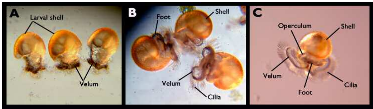
Figure 3. Development of Ovula ovum . (A) Veliger larvae after ca 20 days of development just before hatching; (B) and (C) free-swimming veligers after ca 25 days of development. The larval shell, foot, velum, operculum and cilia are shown.

After 8 days, the larvae reached the veliger stage (Fig. 3). They started accumulating bluish-black pigments that were especially visible in the velum, whereas the foot possessed an operculum, and the cilia crowns were well developed. Furthermore, the shell became clearly visible and the heart was apparent through the transparent body (Fig. 3). On the outside, the stretched capsules seemed larger, measuring ca 5 x 5 mm.