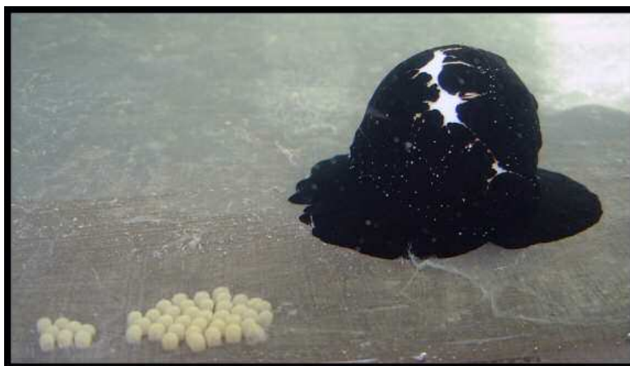
Figure 1. Female Ovula ovum with capsule mass.

O. ovum laid egg capsules every month from July to November on hard substrata (e.g. on the sides of the tanks or inside crevices in the concrete blocks). Spawning either coincided with the full moon or occurred a few days afterward. The laying of egg capsules by a single female could take as long as 74 h, although the average was between 32 and 48 h. Sometimes the process was uninterrupted, even during the daytime. It took between 5 and 15 min to release a single capsule, but the interval between each laying varied greatly. Some females released their capsules in a rapid sequence