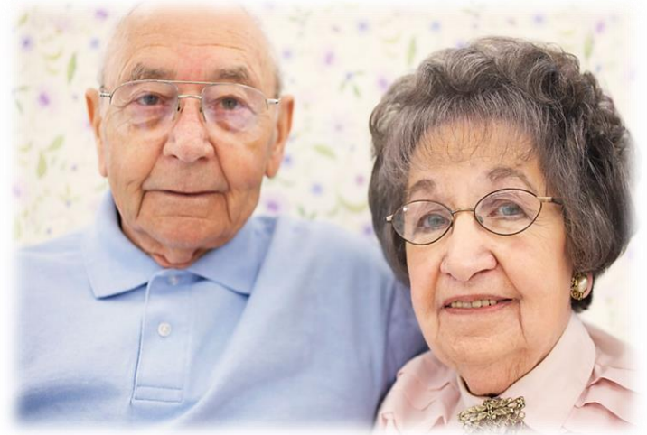
Funding for research to promote healthy aging