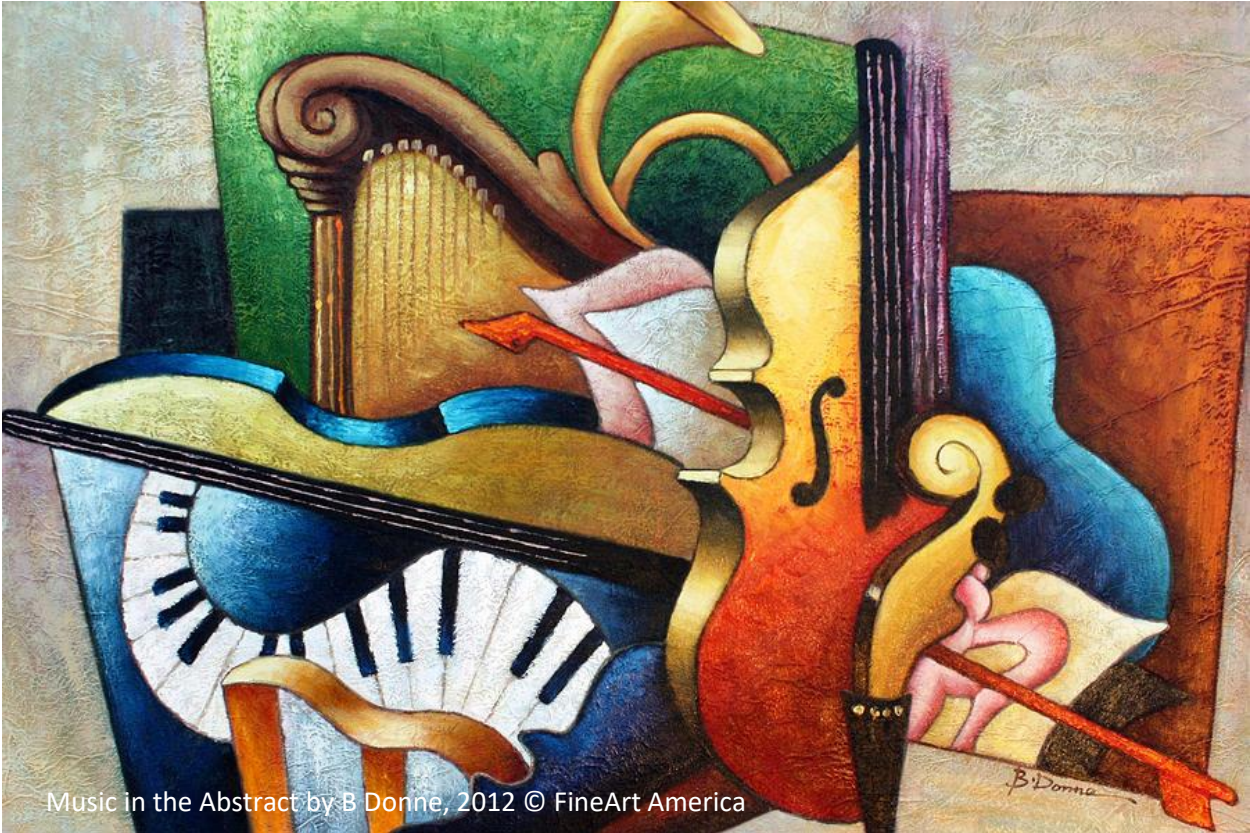
Music in the Abstract by B. Donne, 2012 © FineArt America