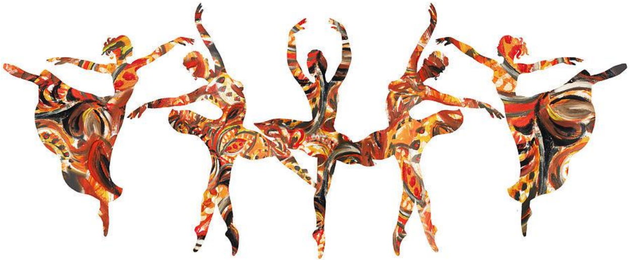
Passionate Floral Dance Abstract, Irina Sztukowski © 2015