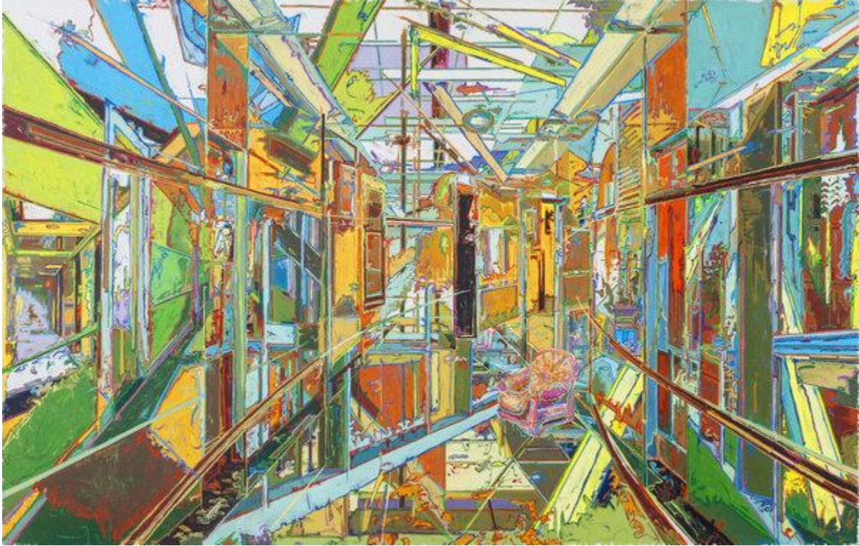
Oil painting Forgotten Vacancy by You Jin © 2016