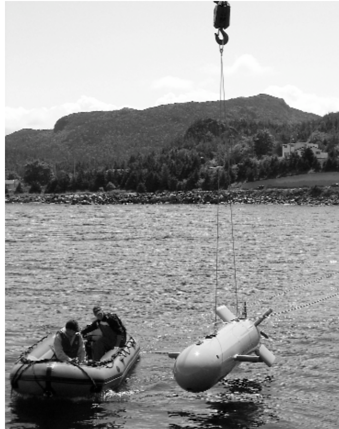
Researchers lower the new Explorer AUV into the water at Holyrood

The MUN Explorer is a 4.5 metre autonomous underwater vehicle (AUV) with a 100 kilometre range which was built by International Submarine Engineering Ltd. (ISE) in Port Coquitlam, British Columbia. Weighing 700 kilograms, it is the only AUV of its size and capability available to the university research community in Canada. In fact, there are only a handful of groups worldwide involved in AUV research and even fewer specifically focused on what engineering researchers at Memorial are undertaking.