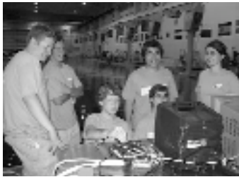
Members of the Eastern Edge Robotics Team

For the second straight year , the Eastern Edge Robotics Team, which includes nine engineering students, captured gold at the Marine Advanced Technology Education (MATE) Center's International Remotely Operated Vehicle (ROV) competition. The event was held this past summer at NASA's Sonny Carter Neutral Buoyancy Lab in Houston, Texas.