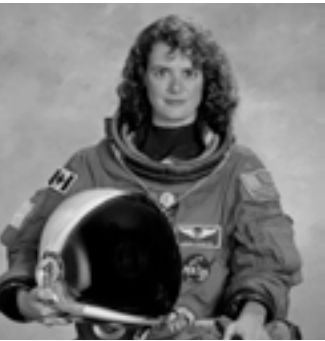
Canadian astronaut Julie Payette

Astronaut Julie Payette spoke to a standing room only crowd of about 400 people recently. The Canadian Space Agency astronaut captivated the crowd, which included children and adults, with images from space, including images of Newfoundland and Labrador from more than 300 kilometres above the earth.