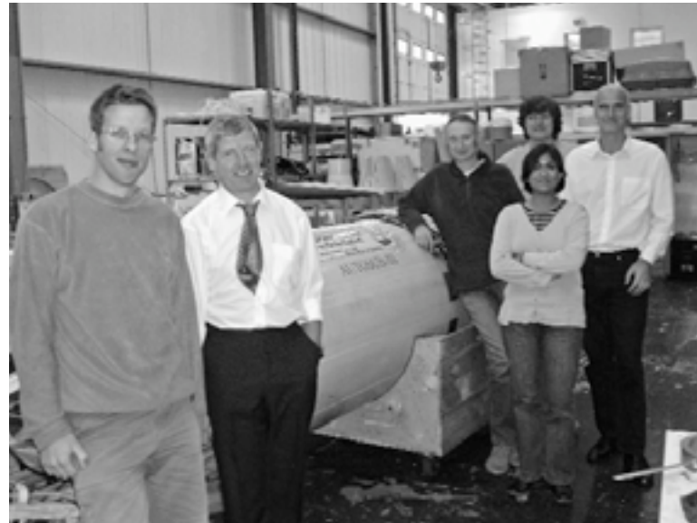
Autosub team of the National Oceanography Centre in Southampton, UK