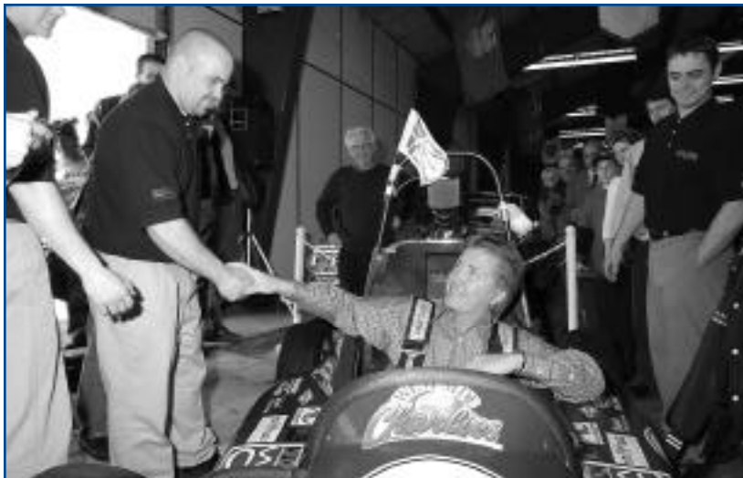
Leader of the Opposition Danny Williams was on hand to officially christen the Formula MUN 2002 car.

The 2002 racing season has come to a close for the Formula MUN racing team. They have been actively competing in Detroit at the Formula SAE World Championships for several years and 2002 was certainly no exception. The team was very optimistic before the May competition and they proved to be strong competition for some of the more recognized of the 140 teams from the United States, Canada and around the world.