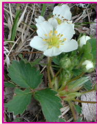
Wild strawberry Fragaria virginiana