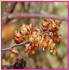
Sweetgale Myrica gale