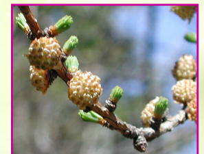
Larch Larix laricina