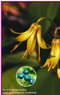
Blue-bead lily Clintonia borealis