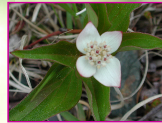
Crackerberry Cornus canadensis

Observation year: _____ Location: _____ Longitude and Latitude: _____