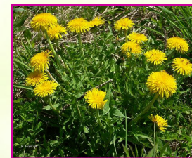
Dandelion Taraxacum officinale