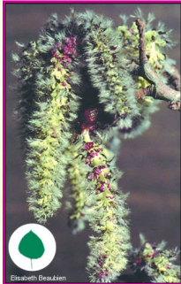
Trembling aspen Populus tremuloides