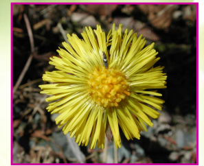
Coltsfoot Tussilago farfara