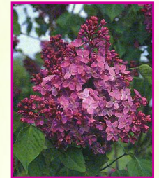
Purple lilac Syringa vulgaris