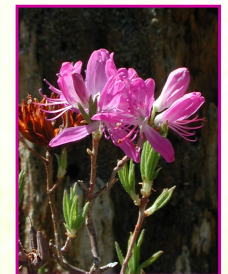
Rhodora Rhododendron canadense