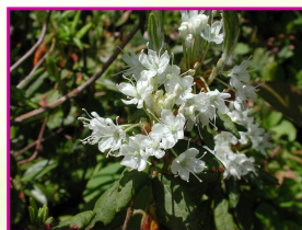
Labrador Tea Rhododendron groenlandicum