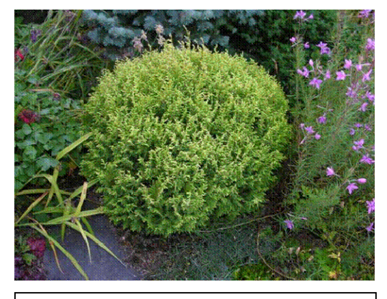
Chamaecyparis pisifera 'Plumosa Flavescens'

for bonsai as many are naturally dwarf and irregular in form. Meanwhile, some are pyramidal while others are rounded and weeping, especially the thread-leaf forms of C. pisifera . Many of the most popular selections have grayish or yellow foliage. We grow several of these false cypress in the