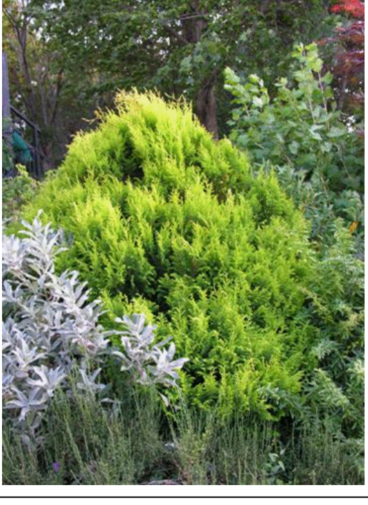
Chamaecyparis pisifera 'Plumosa Aurea Nana'

The Nootka False Cypress ( C. nootkatensis ) is most well known in its