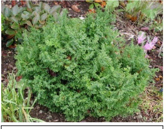
Chamaecyparis obtusa 'Chabo Yadori'

With the exception of C. lawsoniana , the others mentioned are hardy through zone 5 but still benefit from a site sheltered from excess wind. Dwarf forms are prone to being flattened by heavy snow so some winter protection is advised. Full sun is best but green forms are fine for part shade.