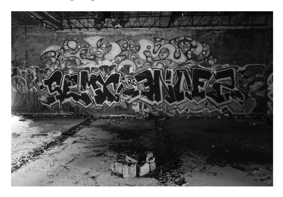
Figure 16.3 Graffiti on interior north wall of operations building at Red Cliff, March 4, 2018, with cinder block hearth in foreground.

(World War II—era artillery batteries, abandoned industrial facilities) and public downtown walls and alleys, where they are visible to a much wider audience and attract the attention of municipal authorities. The use of a cryptic visual grammar that is immediately legible to other artists tactically bounds a community of discourse, and, indeed, a nested series of such communities: graffiti artists in general, the local graffiti community, members of a particular crew.