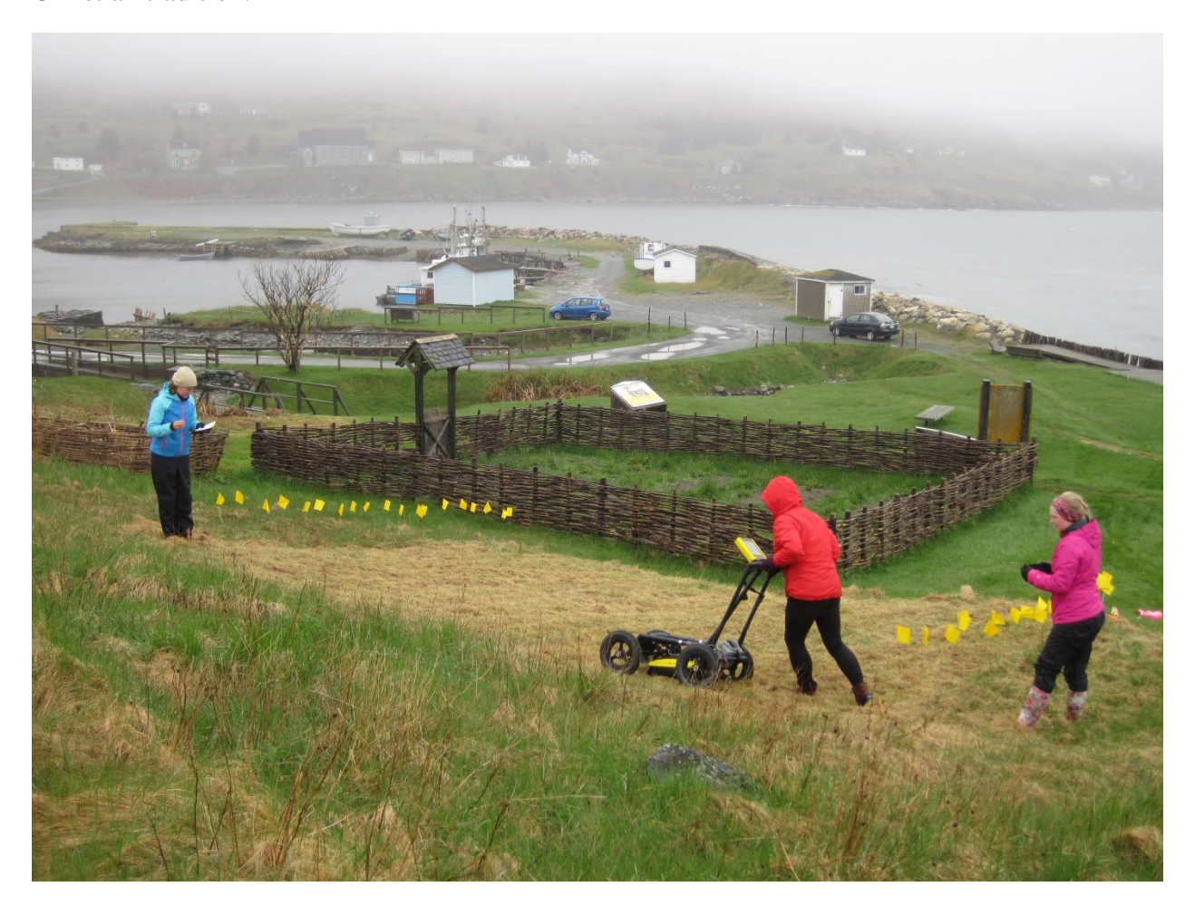
Figure 10: GPR survey at Area D, spring 2016.

information was then applied to Ferryland in a systematic attempt to locate the burial ground associated with the 17<sup>th</sup>-century settlement. Guided by results of the statistical frequency model, a 6-week excavation was planned to investigate previously-unexplored areas directly south and east of the original 4 acre plantation as these locations were statistically the most likely areas for the burial ground if it was situated outside of the fortifications. Before excavations began, Robyn, Maria Lear (Archaeological Curator, MUN) and several volunteers conducted a ground-penetrating radar (GPR) survey of four high-potential areas (Figure 10). Several anomalous features were noted and exploratory test trenches were later dug in a north-south orientation to increase the likelihood of crosscutting a grave shaft, which generally run east to west in the Christian tradition.