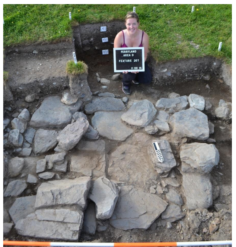
Figure 7: Late 17th-century stone hearth, Area D.