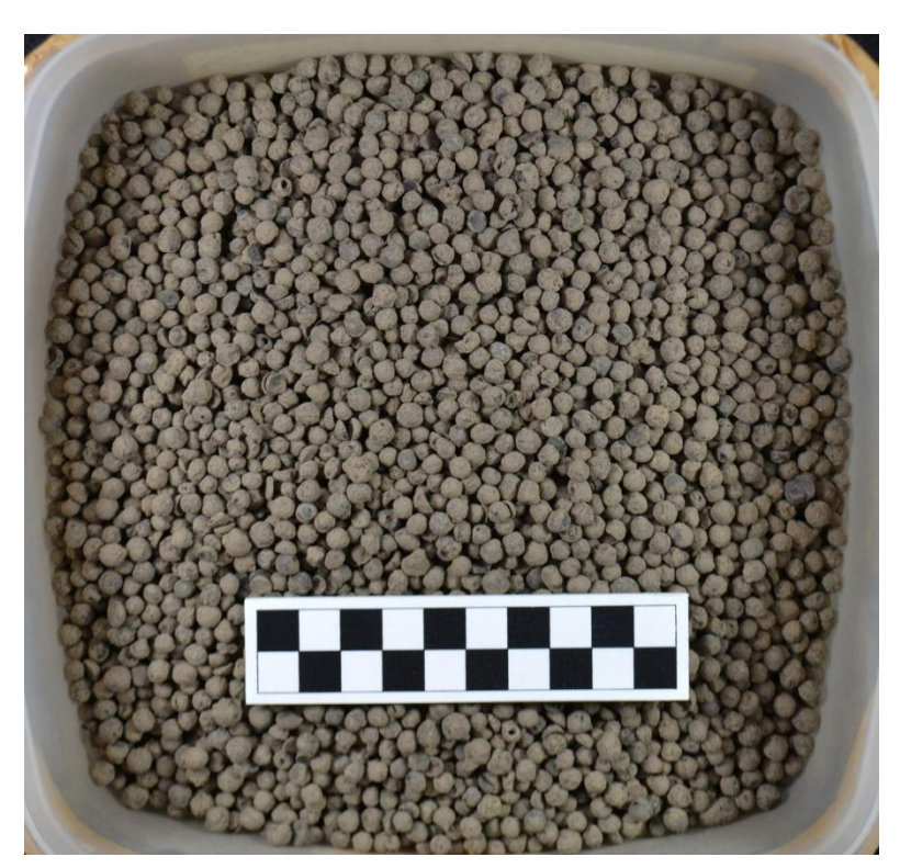
Figure 8: Carbonized peas found in 1994.