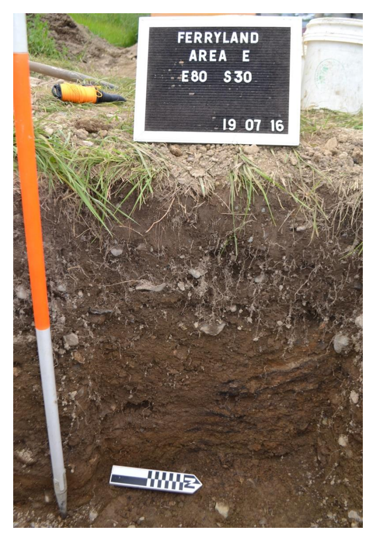
Figure 11: Multiple organic lenses at the bottom half of the profile shows the remains of the earthen rampart.

During the second and third weeks, excavation took place on the hill to the south of the settlement (Ferryland Area E). A preliminary test trench was first dug at the terrace edge directly west of the bastion earthwork. When, at 90 cm dbs, no graves or subsoil were encountered, the area started to become interesting for other reasons. Along the trench walls on the north end, nearest to the hill slope, multiple lenses of black organic material were visible in the profile beginning at 42cm dbs and continuing down to subsoil at 95cm dbs. These were identified as the remains of stacked sods that once formed an earthen rampart (Figure 11). Immediately south was the remains of an infilled ditch, which together comprised the southern defenses at Avalon. The discovery of these features meant that the entire crest of the landform should be devoid of graves and so no further testing was initiated.