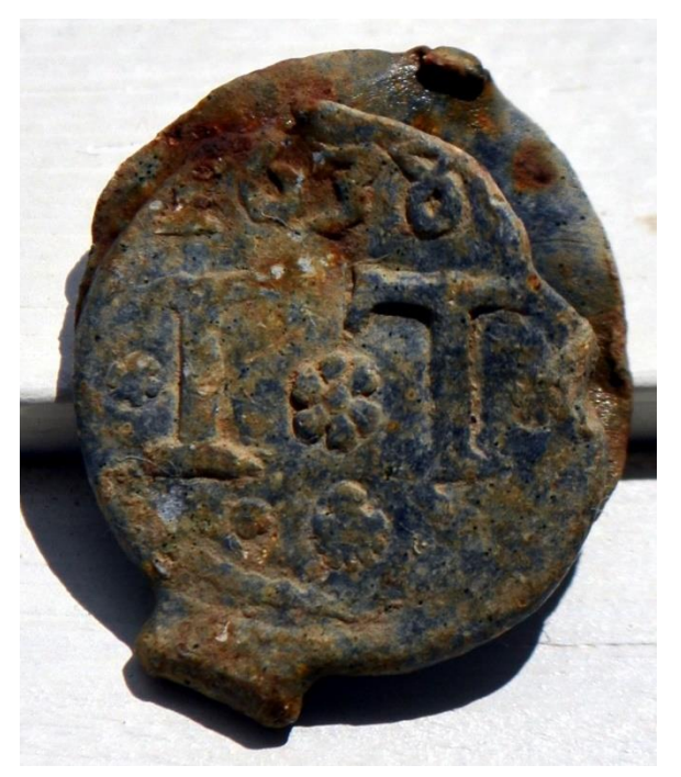
Figure 1: Lead bale seal with IT initials dated 1638.