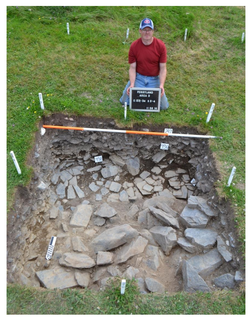
Figure 9: 2x2 metre test unit showing wall rubble and roof slate collapse, Area D.

The second interesting occupation layer revealed through this year's test pitting is located between the stone-lined well and our reproduction kitchen garden. Below the uppermost layer of mixed plough zone was a dense deposit of angular stone rubble containing artifacts from the second half of the 17<sup>th</sup> century including what appears to be two shattered but complete case bottles. Underneath is another layer containing large angular wall rocks and many complete roof slates, the appearance of which suggests a building collapse (Figure 9). Based on current archaeological evidence, only structures built during the Calvert era were roofed in slate, whereas the Kirkes and later residents preferred wood to cover their buildings. If this is in fact the remains of a building with a slate roof then it is the only such structure found outside the original 4 acre settlement. Determining the exact age and function of this potential building will require further excavation.