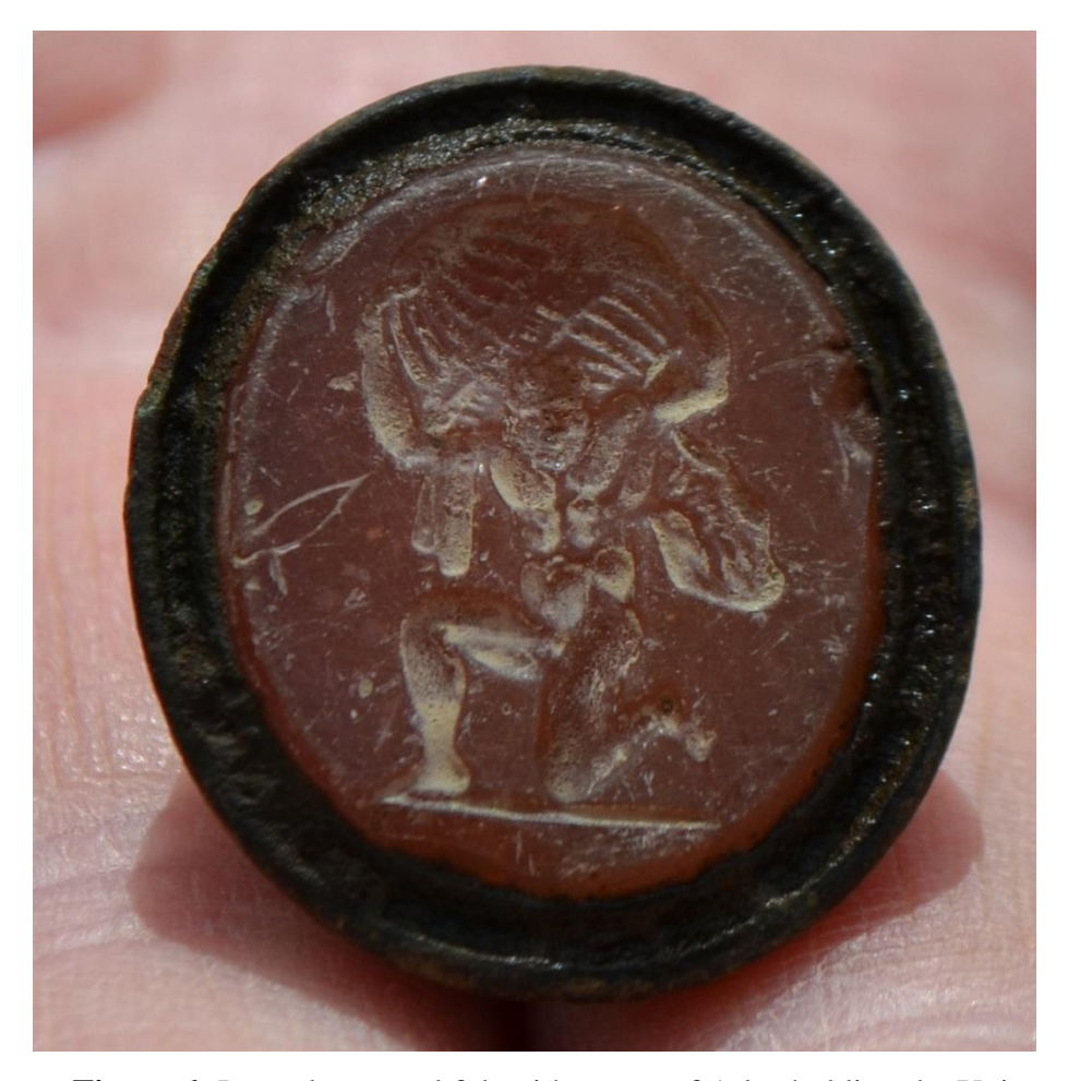
Figure 6: Large brass seal fob with stamp of Atlas holding the Universe.

were located south of the potential road corridor. Each of these 50x50cm pits were expanded into 1 metre units and produced enough artifacts and structural remains to justify further excavation.