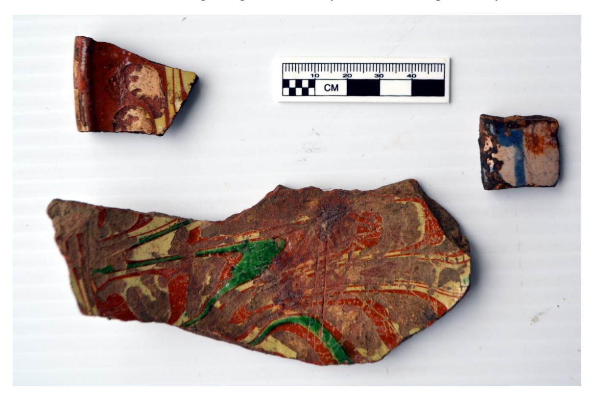
Figure 12: North Italian marbled slipware fragments (left and bottom) and tin-glazed earthenware (right).

Completing those trenches at the beginning of week five, we moved up the hill, south and southeast of the stone-lined well, to excavate a series of test pits in order to check the depth of subsoil before a backhoe arrived. During these tests, an intact 17<sup>th</sup>-century midden deposit was discovered on the Downs, yielding clay tobacco pipes, flint, bottle glass, and various coarse stoneware and earthenware fragments including several pieces of decorative North Italian marbled slipware (Figure 12). This area will be further explored in 2017. At the end of week five, the backhoe arrived and 8 trenches were dug in this area of the Downs and then trowelled down to subsoil in week six. Although none of these trenches revealed human graves, it came with the added bonus of locating a large 18th-century cellar that was previously unknown.