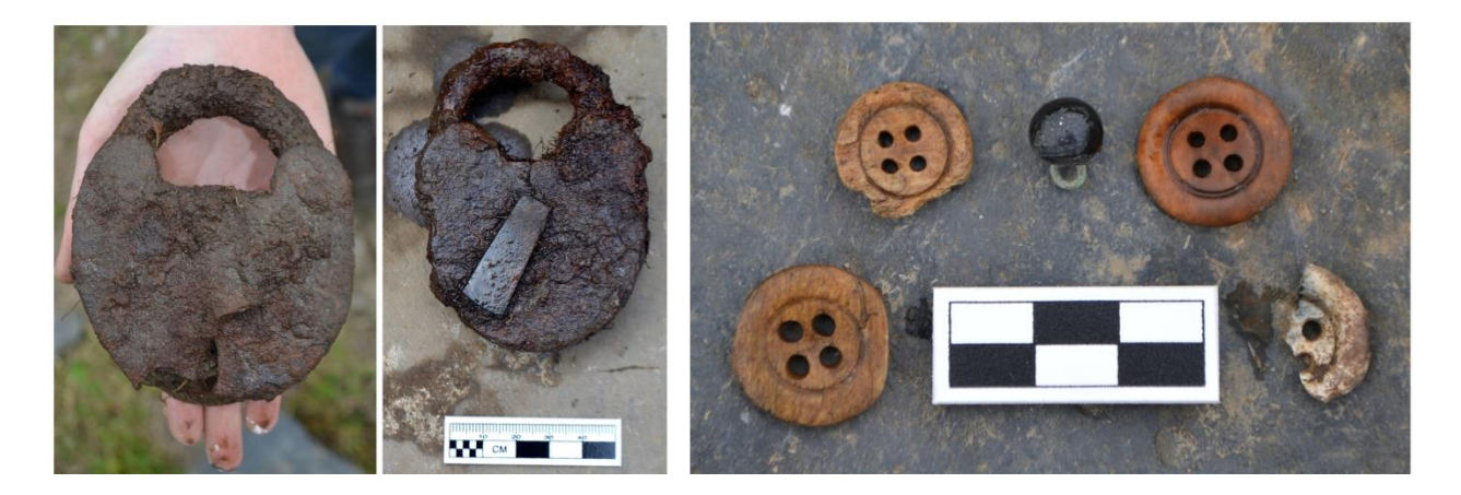
Figure 4: (left) Two padlocks; (right) a selection of buttons.

small mend hole that is hourglass shaped in cross section — has been recorded on other 19<sup>th</sup>-century sites on the Avalon Peninsula as well as in Labrador.